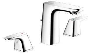
3-Hole Basin Mixer with Pop-Up Drain FFAS1703-1015LOBCO