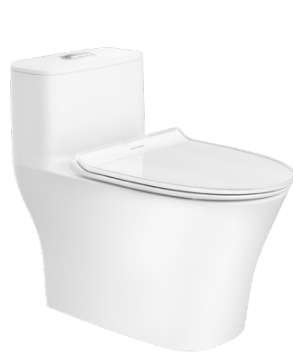
One Piece Toilet L730 x W382 x H650mm CCAS1880-111A410FO (Toilet) CCASC119-U20U420CO (Seat Cover)