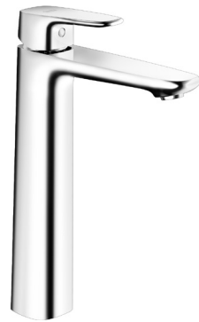
Extended Basin Mono FFAS1707-1015LOBTO