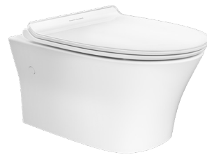
Wall Hung Toilet L550 x W382 x H290mm CCAS2140-0220400FO