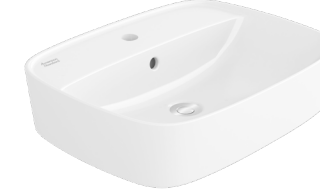
Vessel With Deck (Single hole) L430 x W550 x H125mm CCAS0618-1010410FO