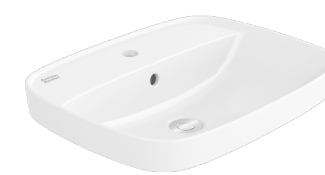
Counter Top Basin L430 x W550 x H50mm CCAS0420-1010410FO