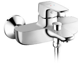
Exposed Bath & Shower Mixer FFAS1711-609500BCO