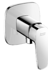
Exposed Shower Mono FFAS1726-701500BTO

The product images shown are for illustration purposes only and is not an exact representation of the final product, which may be subject to further changes.