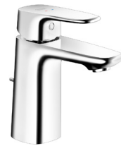
Basin Mixer with Pop-Up Drain FFAS1701-1015LOBCO