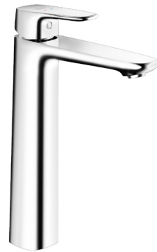
Extended Basin Mixer with Pop-Up Drain FFAS1702-1015LOBCO