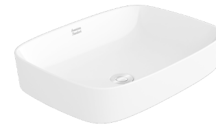
Vessel L400 x W550 x H100mm CCAS0628-0000410FO