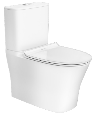
Close Couple Back To Wall Toilet L684 x W406 x H780mm CL26225-6DACTCB