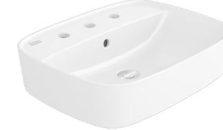
Vessel With Deck (8 inch hole) L430 x W550 x H125mm CCAS0618-1080410FO