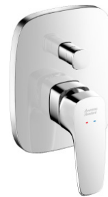
Concealed Bath & Shower Mixer FFAS1721-609500BCO