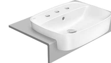
Semi-Counter Basin (8 inch hole) L430 x W550 x H125mm CCAS0320-1080410FO