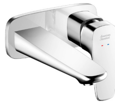
Wall Mount Basin Mixer with Pop-Up Drain FFAS1704-1015LOBCO