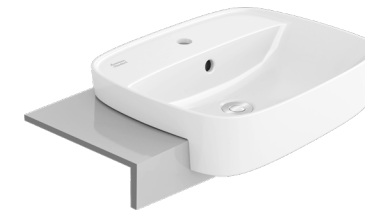
Semi-Counter Basin L430 x W550 x H125mm CCAS0320-1010410FO