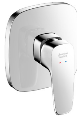
Concealed Shower Mixer FFAS1722-709500BCO