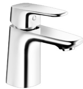
Basin Mono FFAS1706-1015LOBTO