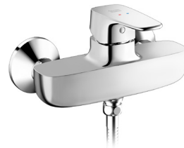
Exposed Shower Mixer FFAS1712-709500BCO