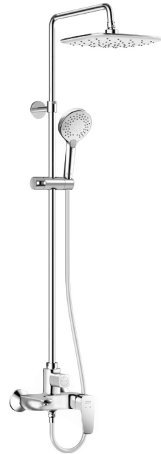
Exposed Bath & Shower Mixer with Rainshower Kit FFAS1772-701500BCO