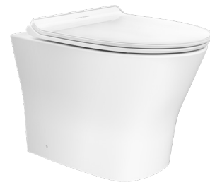
Back To Wall Toilet L560 x W382 x H400mm CCAS2141-0420400FO (S-Trap) CCAS2141-0420401FO (P-Trap)