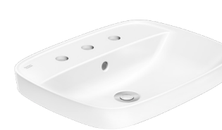
Counter Top Basin (8 inch hole) L430 x W550 x H50mm CCAS0420-1080410FO